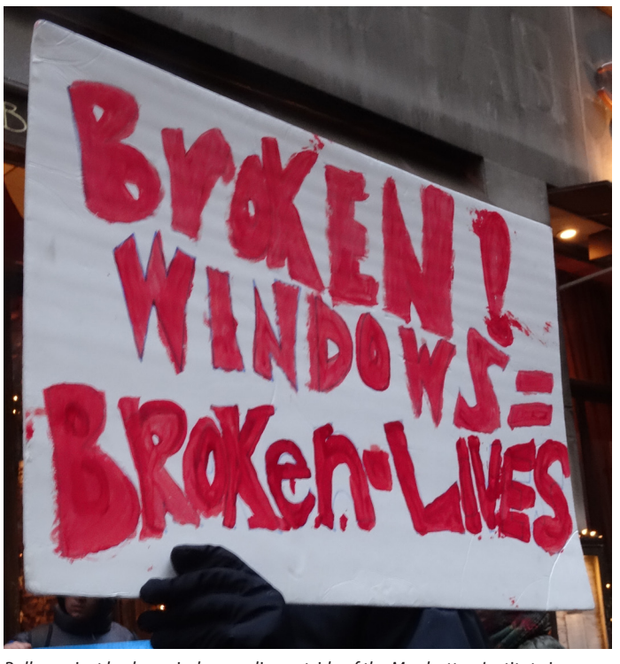
Rally against broken windows policy outside of the Manhattan Institute in New York City, December 10, 2014. Source: Hollow Sidewalks via Flickr. License: https://creativecommons.org/licenses/by/2.0/.

Broken windows policing isn't about reducing crime, it's about assuaging white fear of poor people, Black people, and people of color—no matter how irrational or racialized.