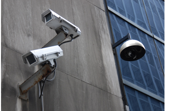
Our high-tech surveillance society had lower-tech precursors.

There are other forms of surveillance and sousveillance. Uberveillance is surveillance through bodily data, like a chip. Dataveillance is the use of surveillance through aggregate data algorithms. In the book, I also coined the term "redditveillance" [to talk about crowdsourced review of surveillance] using pub-