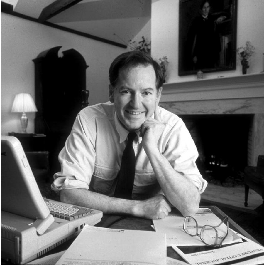
George Gilder in his 1981 book Wealth and Poverty heralded a wave of conservative authors who blame the welfare state for the disintegration of low-income families.

Federal benefits transferred federal payments to the poor, but they also took responsibility for their lives from them. It was a devil’s bargain. The moral lessons most people learn, that they must work and take care of their families if they are to prosper, were blocked for much of the underclass by federal policy. Society normally exacts work or other contributions from its