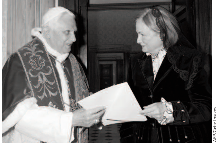
Mary Ann Glendon, traditional family advocate and U.S. Ambassador to the Vatican, meets with Pope Benedict XVI in February 2008.